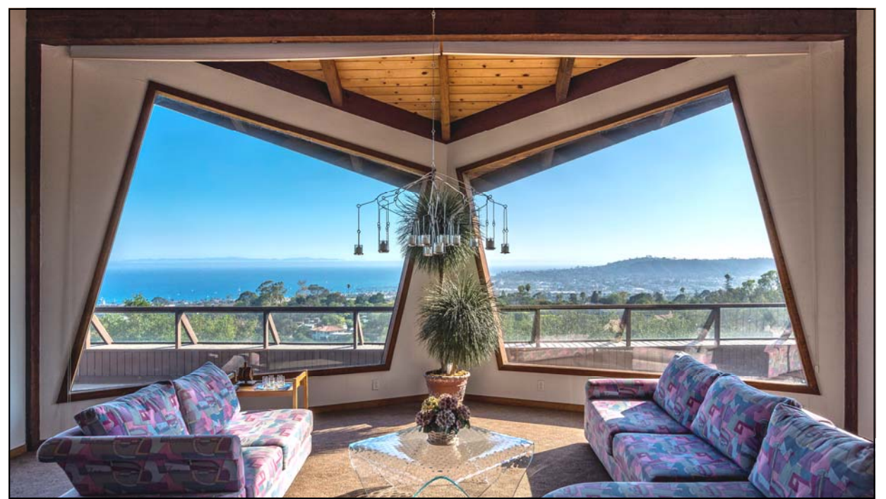
1893 Eucalyptus Hill Road Santa Barbara